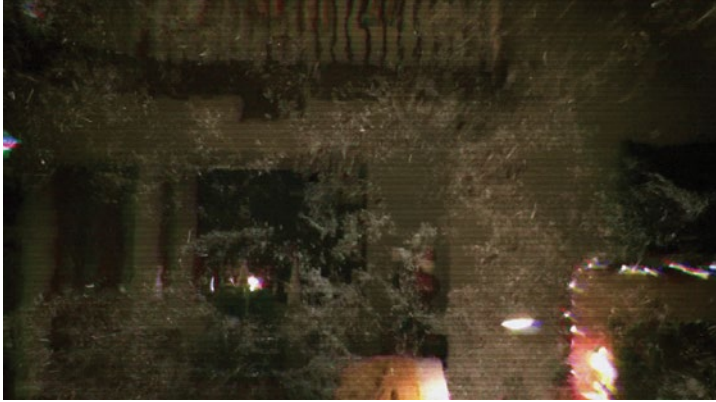
Figure 18.1 Paranormal Activity: The Ghost Dimension (Gregory Plotkin, 2015)