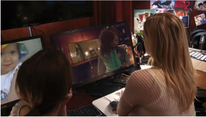
Figure 18.4 Paranormal Activity: The Ghost Dimension (Gregory Plotkin, 2015)