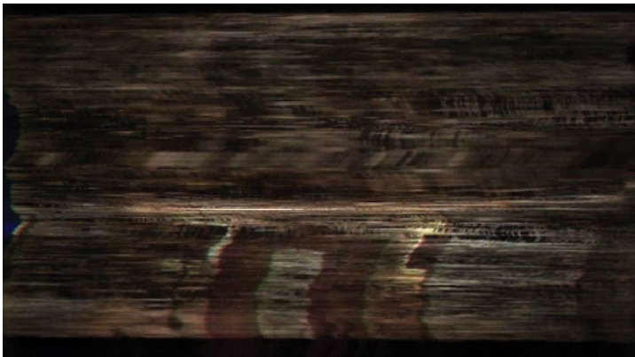
Figure 18.3 Paranormal Activity: The Ghost Dimension (Gregory Plotkin, 2015)